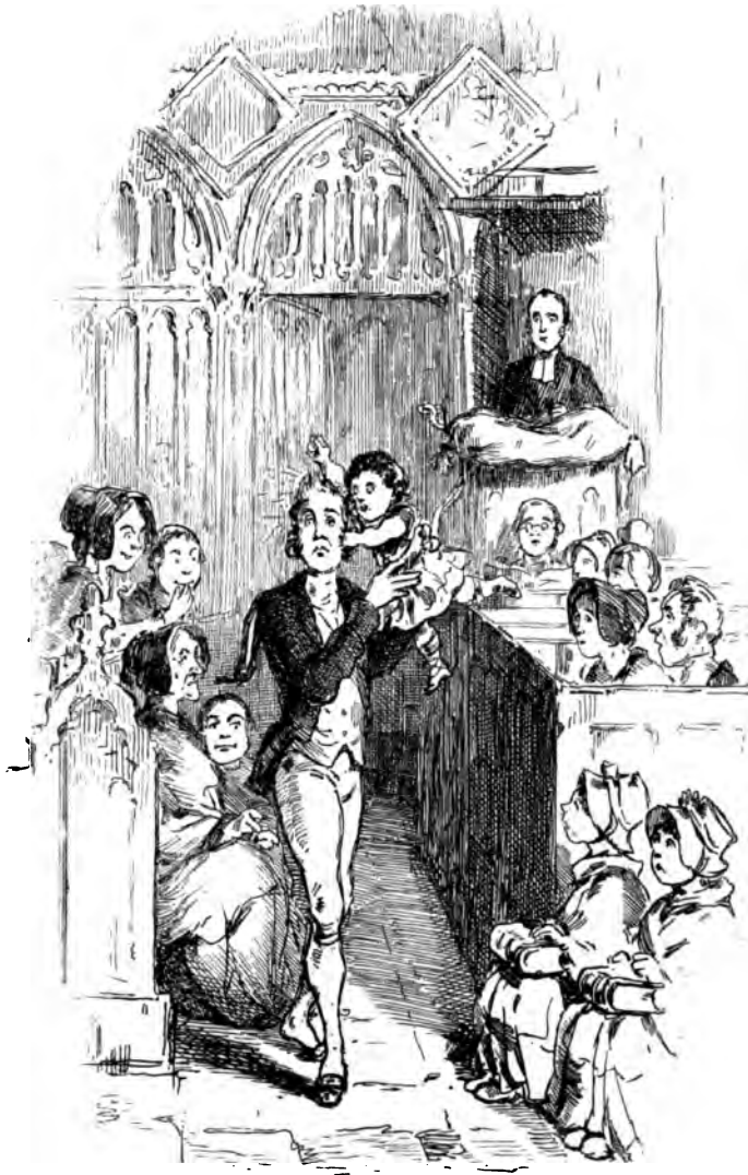
MASTER FRANCIS IN A STATE OF REVOLT